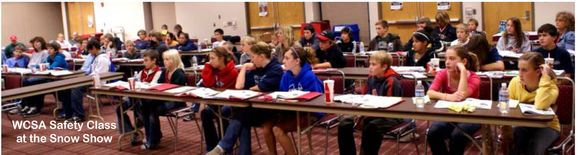
WCSA Safety Class at the Snow Show